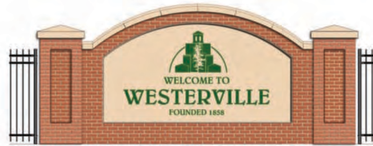
Entrance Signage: I-270/South State Street